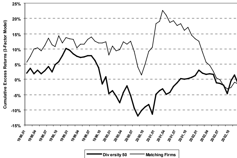
Fig. 1. Cumulative Excess Returns from a 3-Factor Model: Diversity 50 vs. Matching Firms