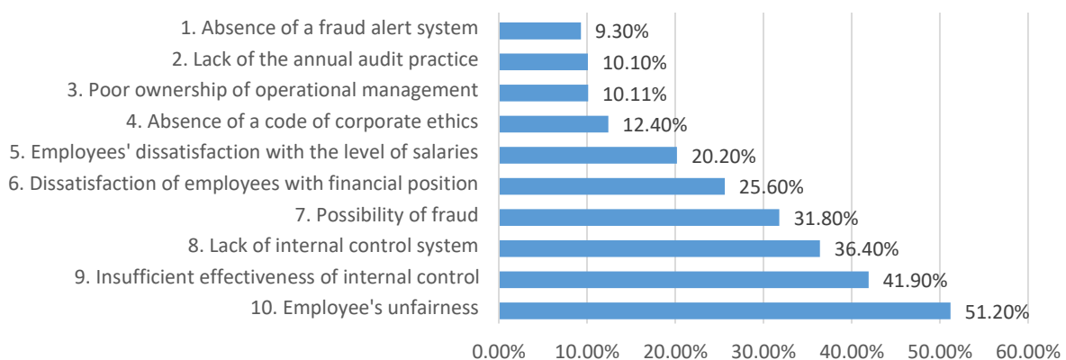
Figure 3. The factors promoting swindling at Ukrainian enterprises, 2016