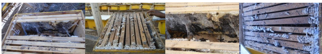
Fig. 2. The effect of wax moth

Modern bee hive technology practices Reasons for discontinuing of modern beehive. In the Table 7 showed that among all adopters 35 (20.5 %) were discontinued modern bee hive production due to different problems. 40 % of the respondents were to absence tough hive management and 40 % due to pest occurrence beyond their controlling mechanism specifically wax moth even though the attempted to manage.