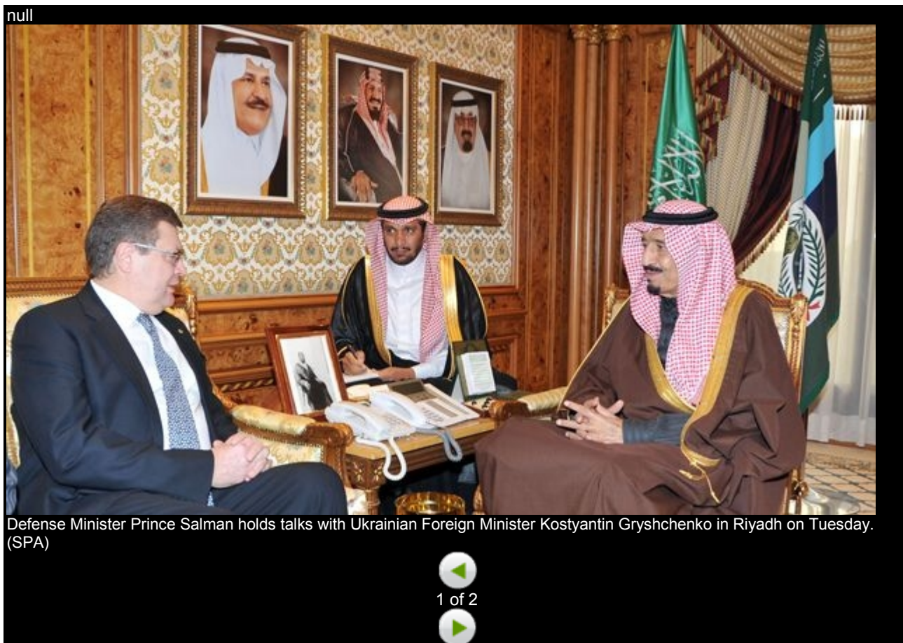
Defense Minister Prince Salman holds talks with Ukrainian Foreign Minister Kostyantyn Gryshchenko in Riyadh on Tuesday.